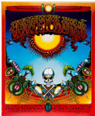
Rick Griffin's Aoxomoxoa

the artwork for years, and I remember feeling one day, like...I finally got my own record player and I put on a Grateful Dead record, I think it was Aoxomoxoa. The music to me was not at all what I expected. This is like some mellow hippie's music and I was expecting skulls and I was expecting something totally different.