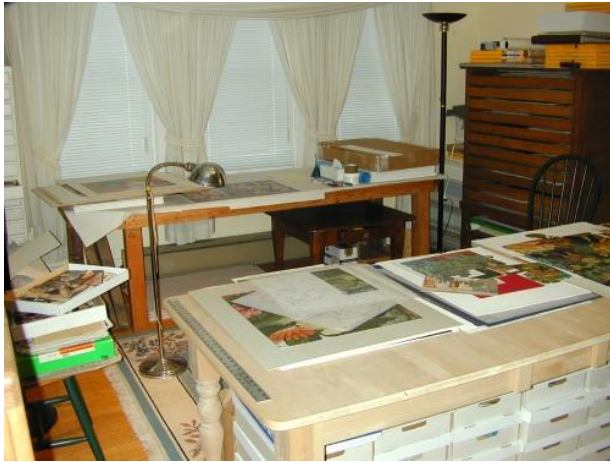
David Singer's Studio

the edge and draw six circles around and make this classic hex sign.